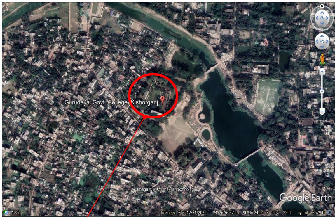
Figure 2: Gurudayal Govt. College, Kishoreganj in Google Map