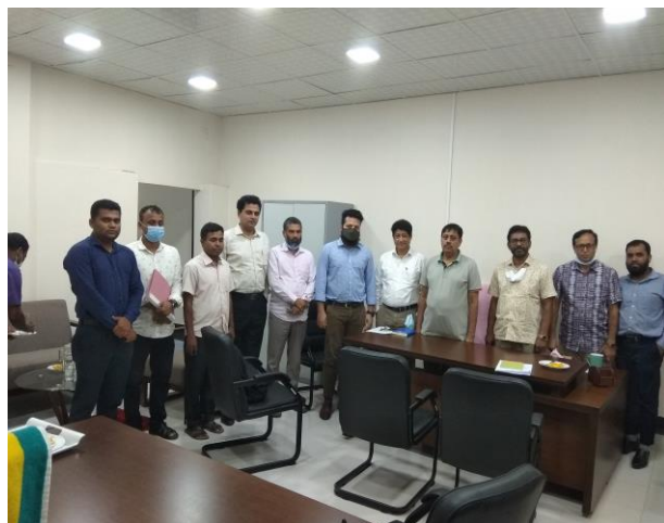
Figure 5: Picture of the public consultation meeting on 1 st June, 2021