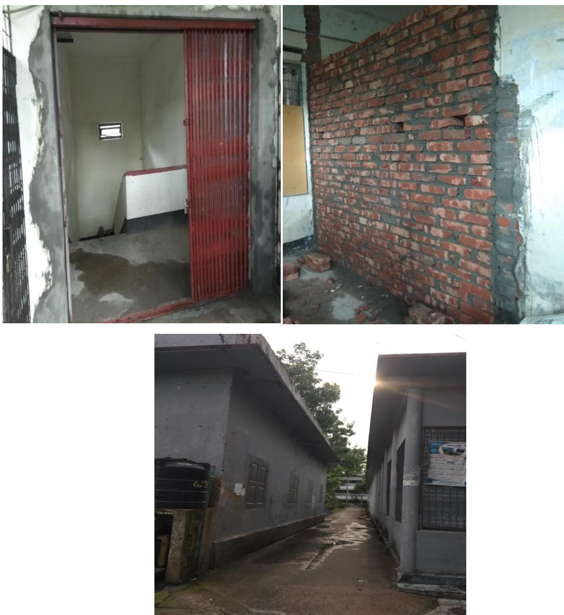
Figure 3: Photographs of the proposed schemes

11. The tentative environmental and social impacts by the sub-projects;