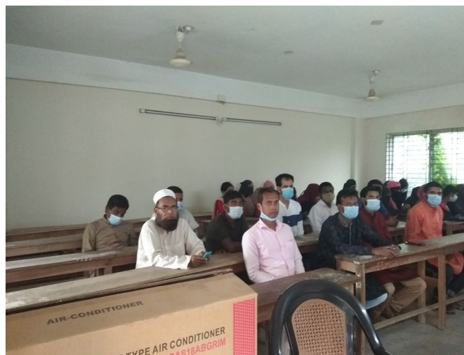
Figure 5: Picture of the public consultation meeting on 16 st June, 2021