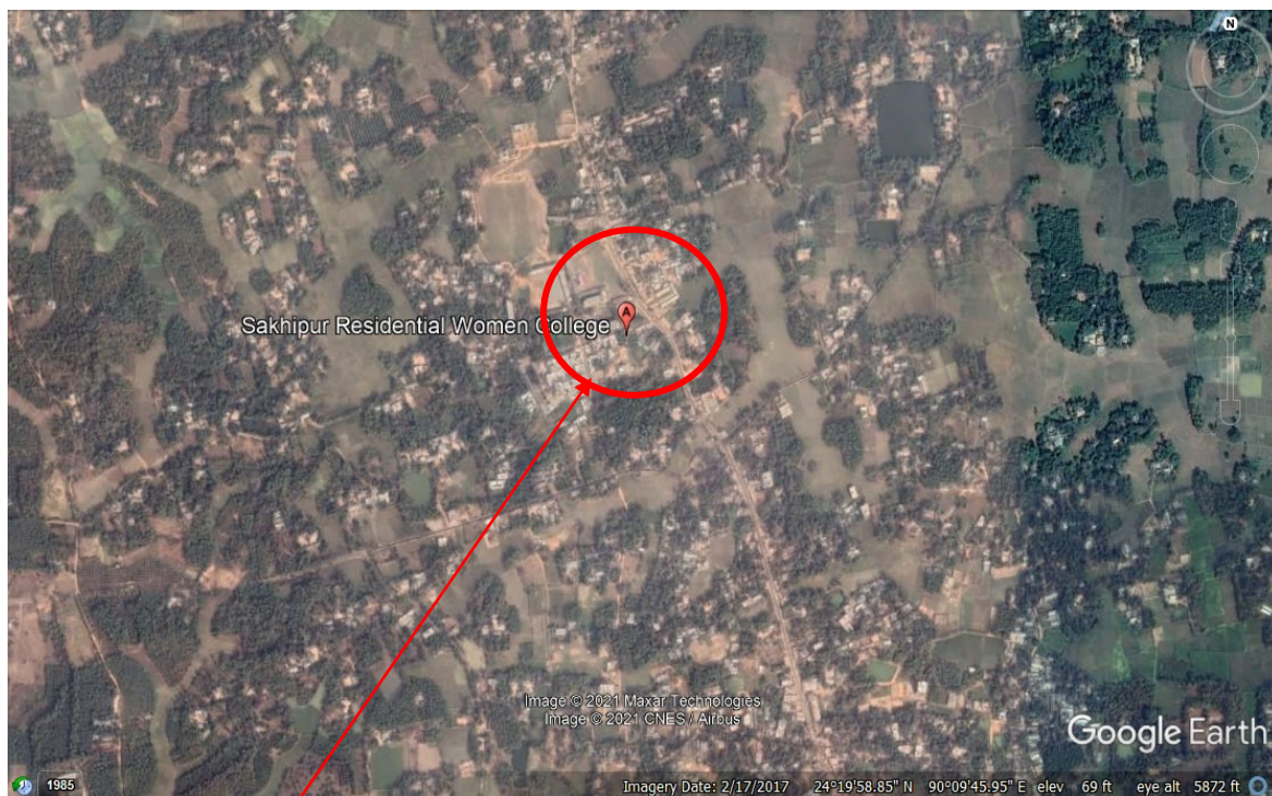
Figure 2: Sakhipur Residential Mohila College, Tangail in Google Map