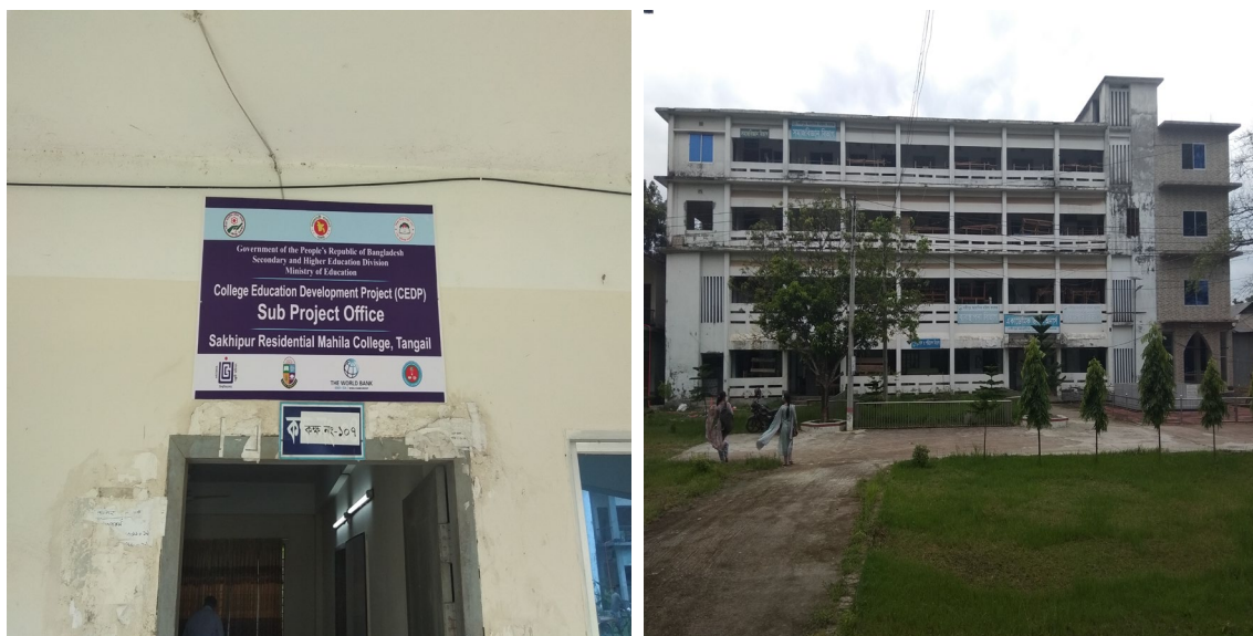
Figure 3: Photographs of the proposed schemes

10. The tentative environmental and social impacts by the sub-projects;