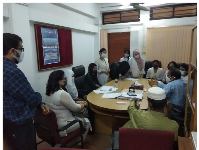
Figure 5: Picture of the public consultation meeting on September 23, 2021