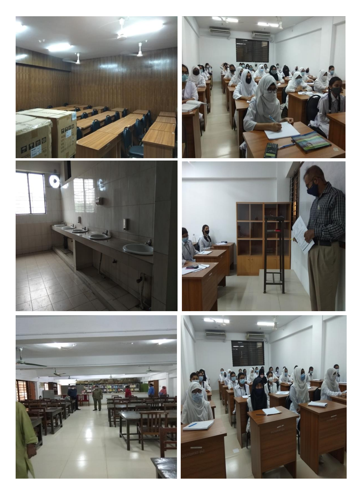
Figure 3: Photographs of the proposed schemes

10. The tentative environmental and social impacts by the sub-projects;