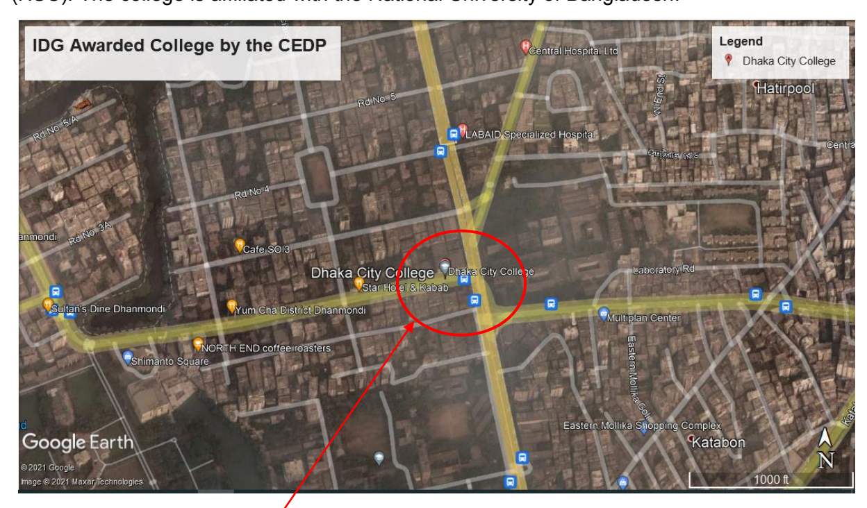
Figure 2: Dhaka City College, Dhaka in Google Map